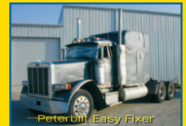
Peterbilt Easy Fixer