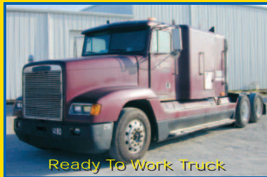
Ready To Work Truck