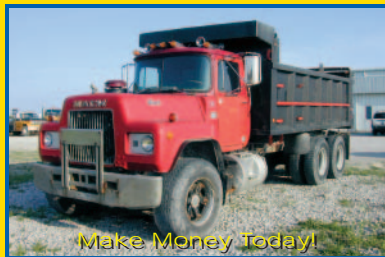
Make Money Today!