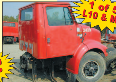
1 of 5 - L10 & M11