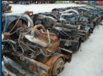
SEVERAL INTERNATIONAL DT466 FRAME CUTS