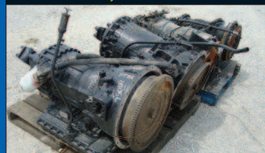
SEVERAL LATE MODEL ALLISON TRANSMISSIONS