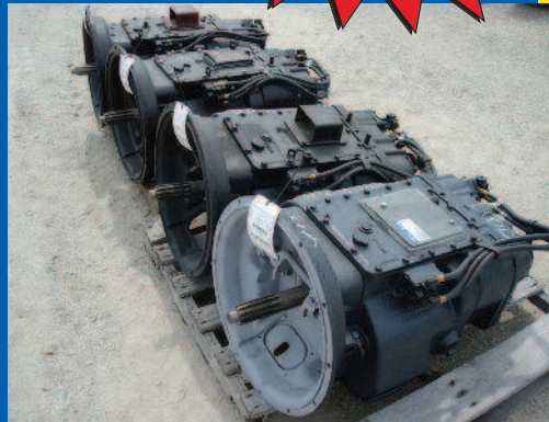
SEVERAL REBUILT 18 SPEED TRANSMISSIONS