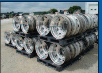
ALUMINUM POLISHED WHEELS