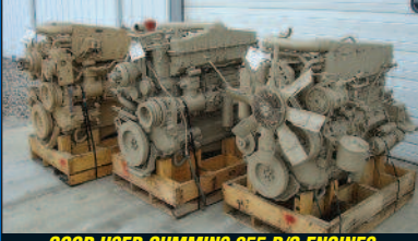
GOOD USED CUMMINS 855 B/C ENGINES