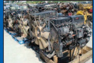
CUMMINS M11 ENGINES