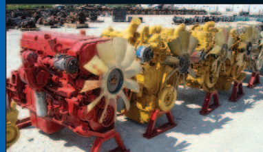
SEVERAL CUMMINS, ISX & CATERPILLAR ENGINES