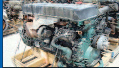
VOLVO VED12 ENGINE