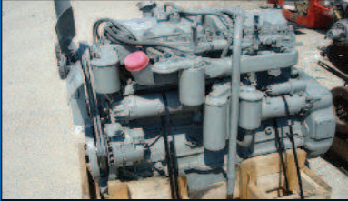
GOOD USED E6 MACK ENGINE