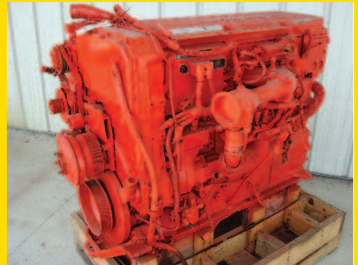
2002 CUMMINS ISX 500HP CPL 8285, S/N#14031552, EGR, GOOD RUNNER