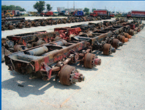
ROWS OF TANDEM CUTOFFS