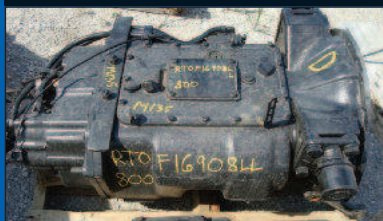
FULLER RTOF 16908LL USED TRANSMISSION