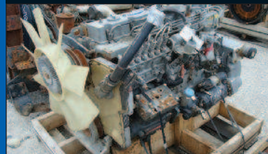
CUMMINS 8.3 ENGINE