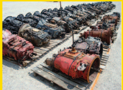
HUNDREDS OF TRANSMISSIONS