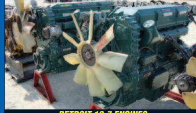
DETROIT 12.7 ENGINES