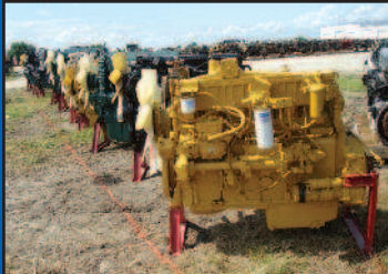
HUNDREDS OF CATERPILLAR & CUMMINS ENGINES