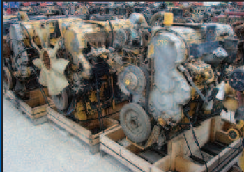
CATERPILLAR 3406E TAKEOUTS