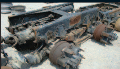
46,000LB ROCKWELL HENDRICKSON CUTOFF