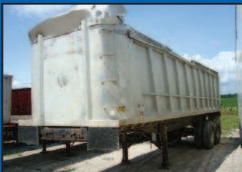
30' BENSON ALUMINUM DUMP TRAILER