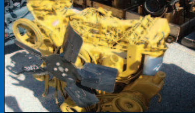
CATERPILLAR 3208 ENGINE