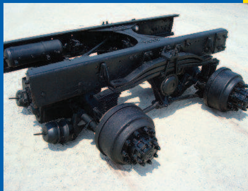
46160 LOCKERS, 4.89 RATIO, VOLVO V BAR, 10 HOLE HUB PILOTTED