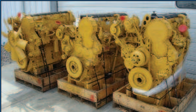
GOOD USED CATERPILLAR C15 ENGINES