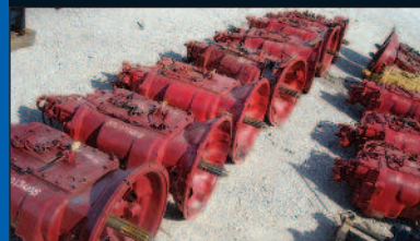
SUPER 10 TRANSMISSIONS: TAKEOUTS & CORES