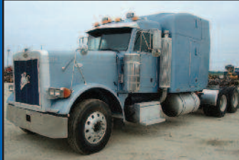
1997 PETERBILT 379, N14 CELECT PLUS, RTL016610B, DS404, EFA12F4, ENGINE PROBLEM