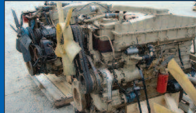
CUMMINS 855 B/C ENGINES