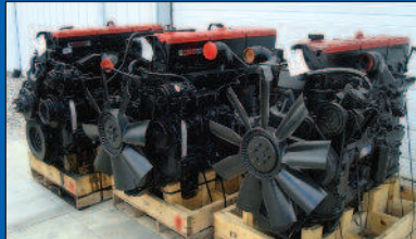
GOOD USED CUMMINS N14 RED TOP ENGINES