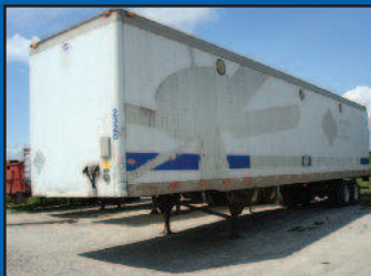
UTILITY 48' VAN TRAILER