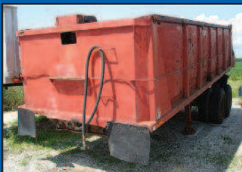
21' STEEL DUMP TRAILER