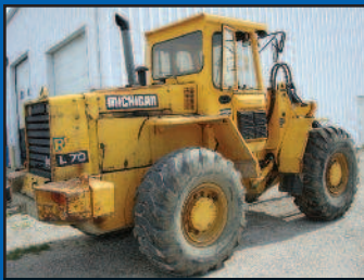
MICHIGAN L70 LOADER