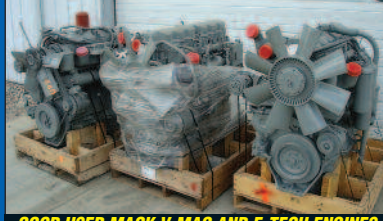
GOOD USED MACK V-MAC AND E-TECH ENGINES