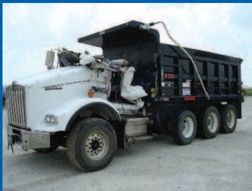
2007 KENWORTH T800, 16' DUMP TRUCK, ISX 475HP CHALMERS 800, CAB DAMAGED