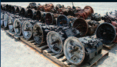
HUNDREDS OF FULLER & ROCKWELL TRANSMISSIONS