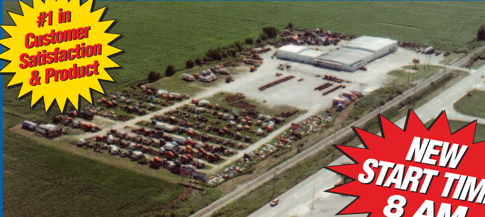
GEIGER TRUCK PARTS