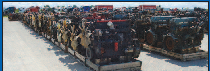
ENGINES, ENGINES, ENGINES & MORE ENGINES!!! TRUCKLOADS TO CHOOSE FROM!!!