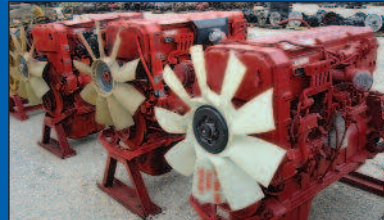
CUMMINS ISX ENGINES: TAKEOUTS & CORES