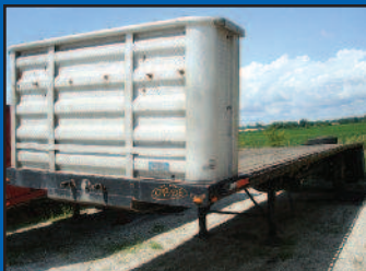
48" TRANSCRAFT FLATBED TRAILER