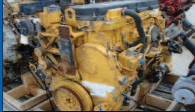
CATERPILLAR C13 TAKEOUT