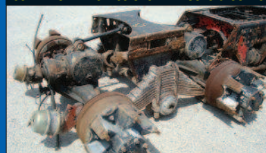
44,000 LB MACK CUTOFF