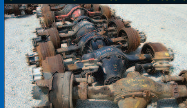
LARGE SELECTION OF 2 SPEEDS