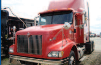
2002 IHC 9400, ISX 400HP, M14610AM16, 20145, FF981, ENGINE TAKEN APART