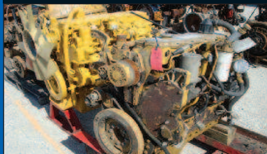
CATERPILLAR 3126 ENGINES