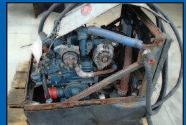
PRO HEAT GEN4 APU UNIT