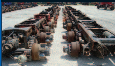
YARD FULL OF TANDEM CUTOFFS