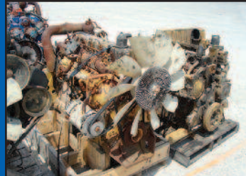
CATERPILLAR 3306 ENGINES