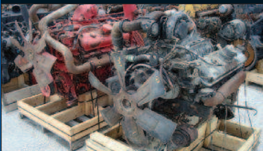
DETROIT 6V92 ENGINES