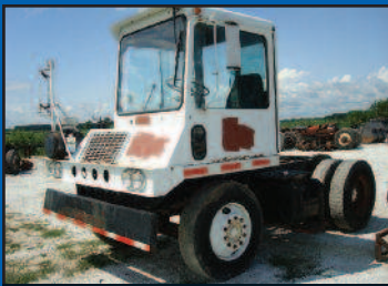
YARD SPOTTER, 3208, MT643, HYD 5TH WHEEL