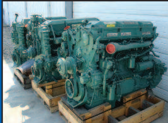
SEVERAL GOOD USED 60 SERIES DETROITS