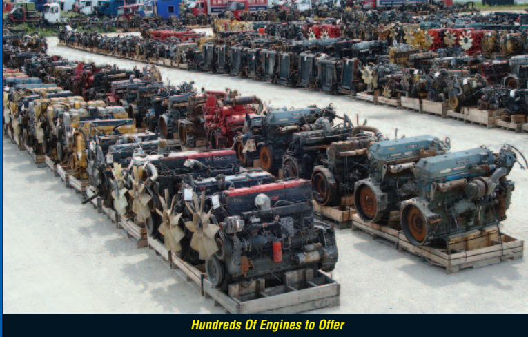
Hundreds Of Engines to Offer