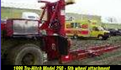
1999 Tru-Hitch Model 250 - 5th wheel attachment