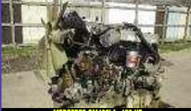
MERCEDES OM460LA, 450 HP