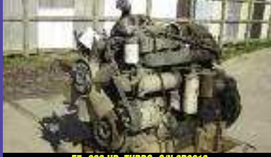
E7, 300 HP, TURBO, S/N 8R3313