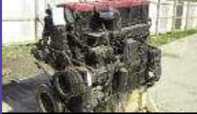
N14 ESP-, 435 HP, JAKES, TURBO, (DYNO TESTED)