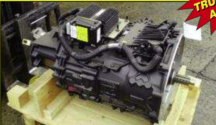
NEW Meritor MOZ12A Transmission 1 of 2