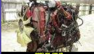
(2005) ISX, 500 HP