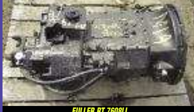
FULLER RT 7608LL