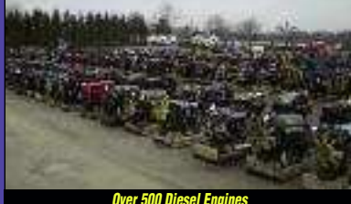
Over 500 Diesel Engines