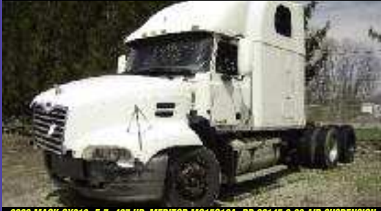
2000 MACK CX613, E-7, 427 HP, MERITOR M015G10A, RD 20145 2.93 AIR SUSPENSION