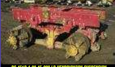
DS 451P 4.88 45,000 LB HENDRICKSON SUSPENSION