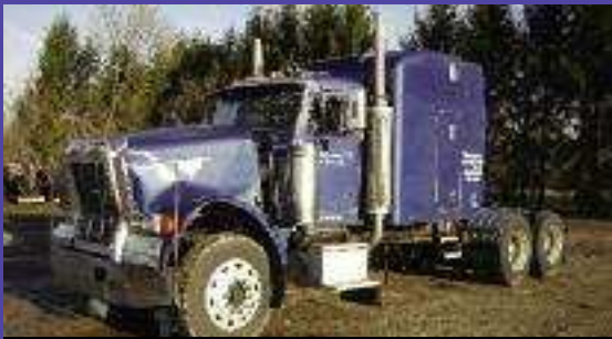
1997 Peterbilt 379 N-14, FULLER 10 SPEED, DS 404 3.70 AIR SUSPENSION