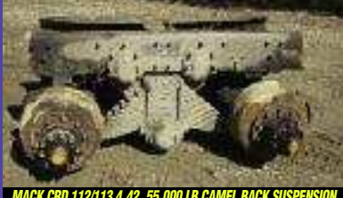
MACK CRD 112/113 4.42, 55,000 LB CAMEL BACK SUSPENSION