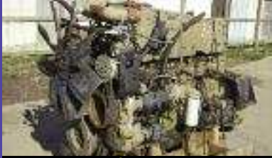
B/C IV, 350 HP