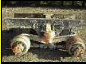
DS451P 4.88 45,000 LB CHALMERS SUSPENSION