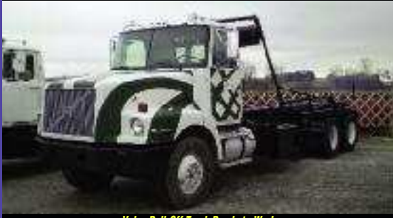
Volvo Roll-Off Truck Ready to Work