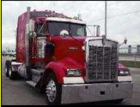
1997 Kenworth W900 Cummins 500hp Light Damage Runs & Drives