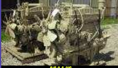
B/C 2 & 3'S