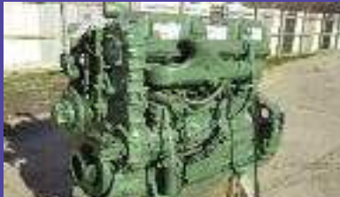
DETROIT 12.7 500 HP, DDEC III, JAKES, TURBO, (DYNO TESTED)