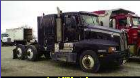
Kenworth T600 Cummins Power