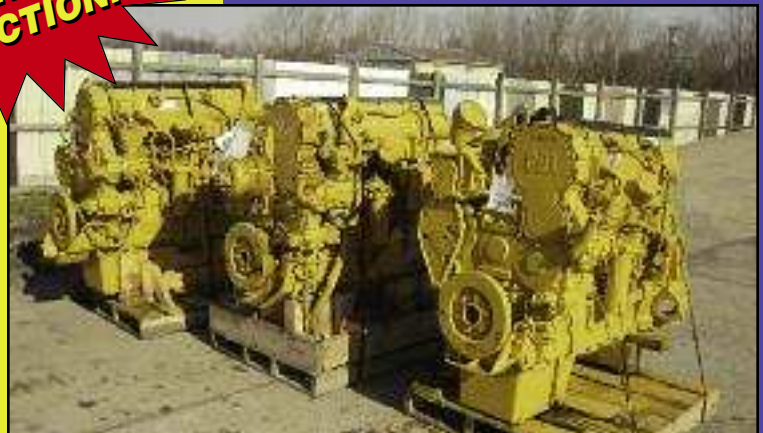
C-15 (REMANS) 435 & 475 HP, (LOW MILES)