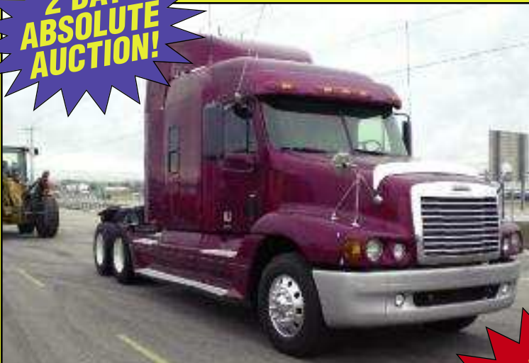
2005 Freightliner Century ST120 Detroit 14.0L Light Cab Damage Runs & Drives