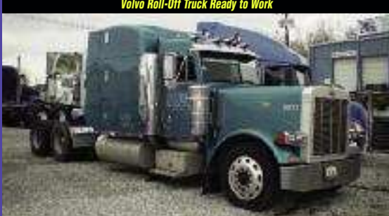
1999 Peterbilt 379 Cat 550hp Running and Driving