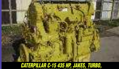
CATERPILLAR C-15 435 HP, JAKES, TURBO, S/N MISX67727, (DYNO TESTED)