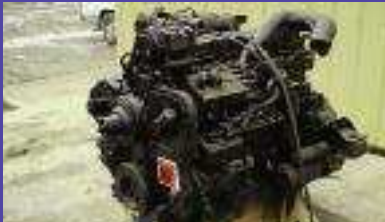
Cummins ISC 330hp Only 50k miles