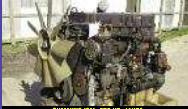
CUMMINS ISM, 370 HP, JAKES