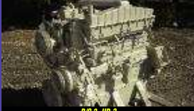
B/C 3, HP-?