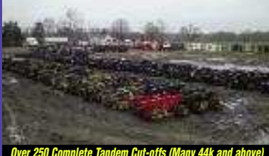
Over 250 Complete Tandem Cut-offs (Many 44k and above)