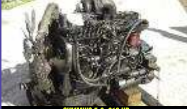
CUMMINS 5.9, 210 HP