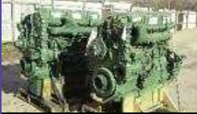
12.7 (REMANS) 500 HP, DDEC III & IV