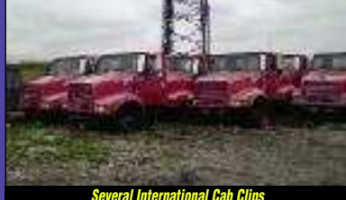
Several International Cab Clips