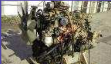
CATERPILLAR 3306, 300 HP, 143,000 MILES