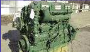
DETROIT 12.7 500 HP, DDEC IV, JAKES TURBO, (DYNO TESTED)