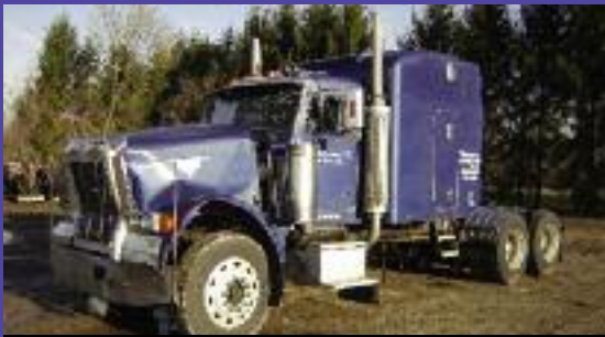
1997 Peterbilt 379 N-14, FULLER 10 SPEED, DS 404 3.70 AIR SUSPENSION