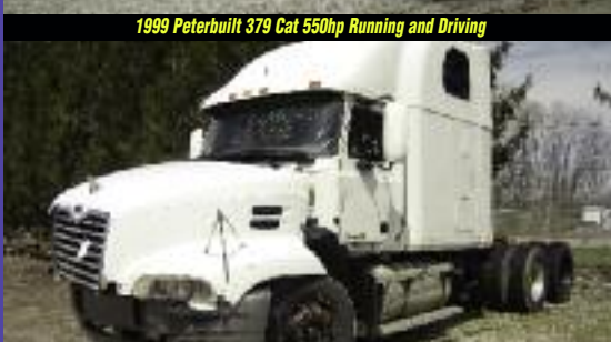
2000 MACK CX613, E-7, 427 HP, MERITOR M015G10A, RD 20145 2.93 AIR SUSPENSION