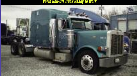
1999 Peterbilt 379 Cat 550hp Running and Driving