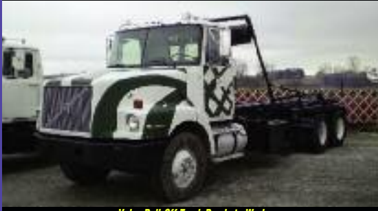
Volvo Roll-Off Truck Ready to Work