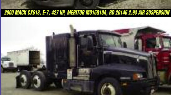
Kenworth T600 Cummins Power