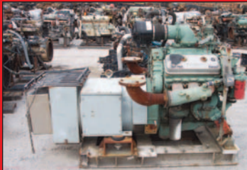
Detroit 6V71N 125KW Gen Set

NEW TRW Steering Gear plus 100s of used take-offs for all manufacturers & models