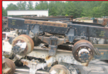
DS 402 4.33 Ratio