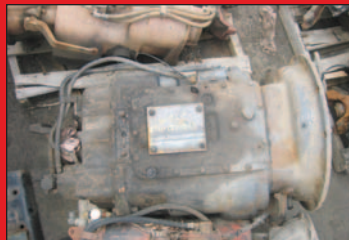
Fuller RTLO 18718 B