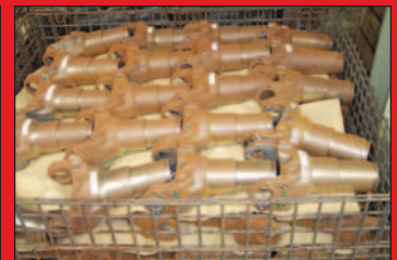
NEW Slip Yokes