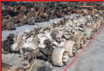
Front Drive Steer Axles, Eaton, FABCO, Rockwell & Oshkosh