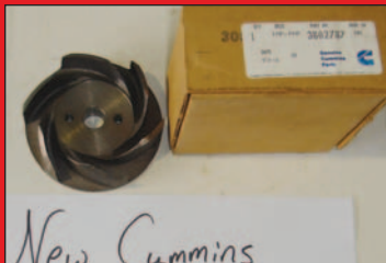
NEW Cummins Water Pump Parts