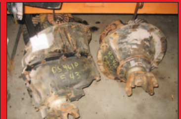
Matched Set of DS461P