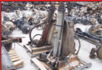
Dump Cylinder Kits & Wet Kits