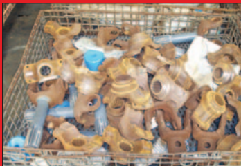
Miscellaneous New Drive Line Parts