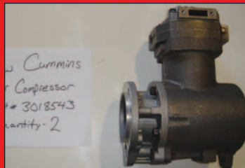
NEW Cummins Air Compressors