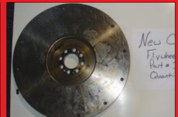
NEW Cummins Flywheels