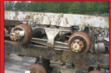
DS 521P 5.43 Ratio