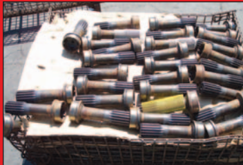
NEW DRIVE SHAFT PRODUCTS