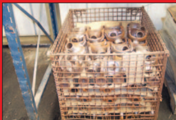
NEW End Yokes