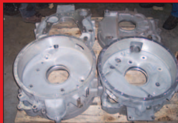
NEW OEM Mack Flywheel Housings