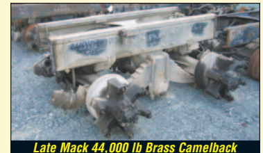
Late Mack 44,000 lb Brass Camelback