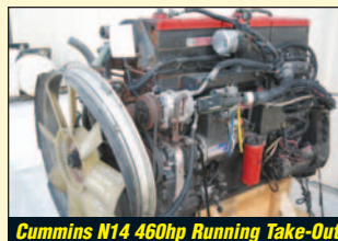
Cummins N14 460hp Running Take-Out