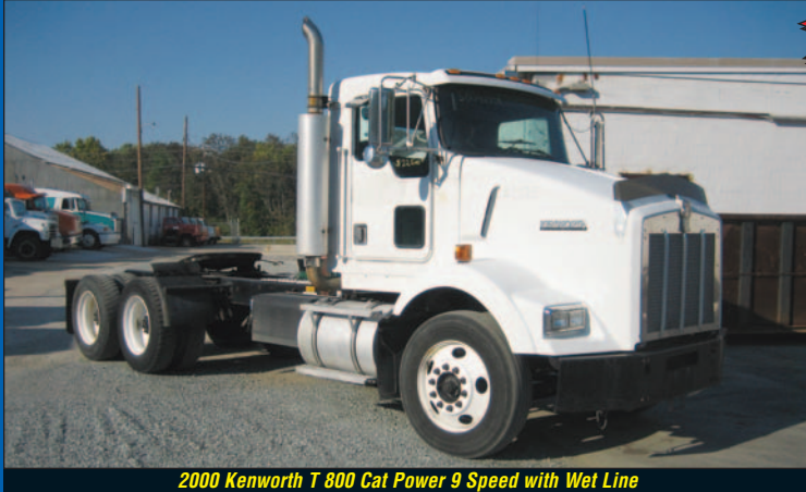
2000 Kenworth T 800 Cat Power 9 Speed with Wet Line