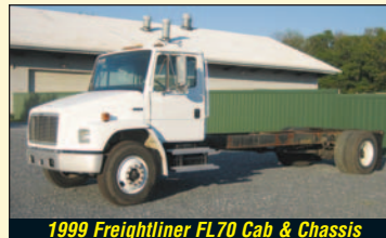
1999 Freightliner FL70 Cab & Chassis