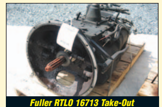
Fuller RTLO 16713 Take-Out