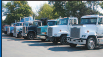
Lots of Late Model Trucks