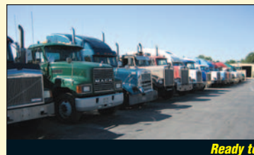
Ready to Work Trucks