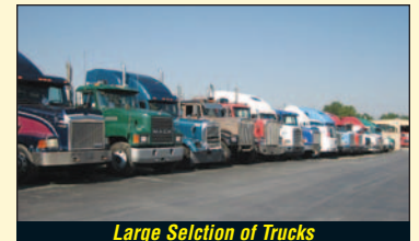
Large Selection of Trucks