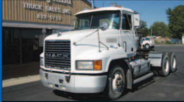
1998 Mack CH 613