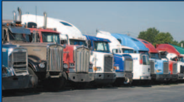
Many Quality Trucks to Choose from