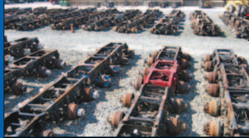
Large Assortment of Heavy Tandem Cutoffs