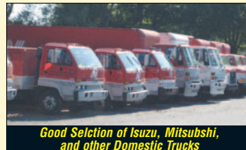
Good Selection of Isuzu, Mitsubishi, and other Domestic Trucks