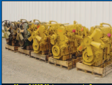
Many 3406E Motors runners to Cores