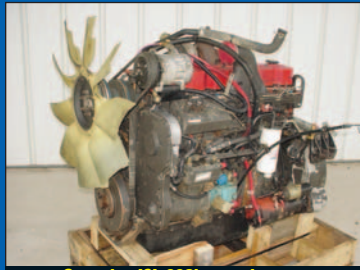
Cummins ISL 330hp good runner