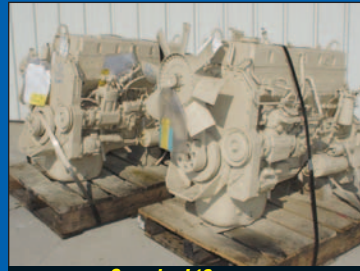
Cummins L10 runner