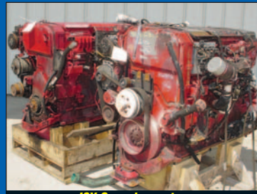
ISX Cummins motors