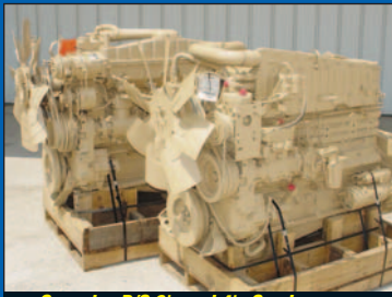
Cummins B/C 3's and 4's Good runners