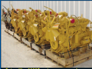
Caterpillar 3306C motors runner and cores

BA BERRYHILL AUCTIONEERS www.BerryhillAuctioneers.com