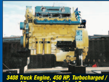
3408 Truck Engine, 450 HP, Turbocharged / After-cooled, Good Used Runner