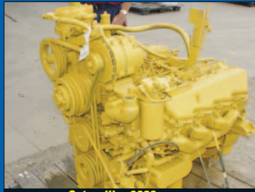
Caterpillar 3208 runner