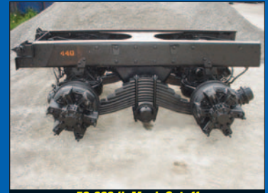
50,000 lb Mack Cutoff