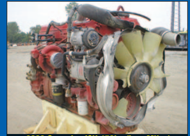
2006 Cummins ISX 450hp (Low Miles)