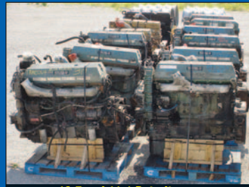
12.7 and 11.1 Detroit cores