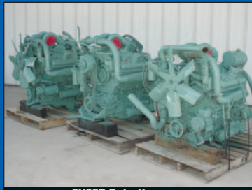
6V92T Detroit runners