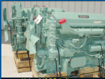
11.1 and 12.7 Detroit runners