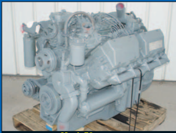
Mack E9 runner