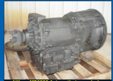
Allison MD3560 Automatic transmission