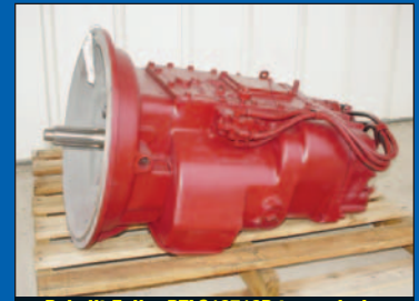
Rebuilt Fuller RTL018718B transmission