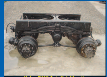
Volvo EV87 Cutoff 4.30 ratio