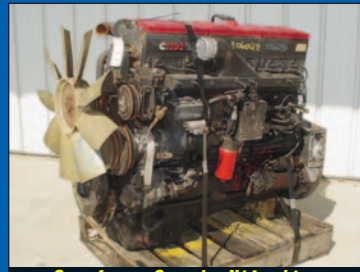
One of many Cummins N14 red tops